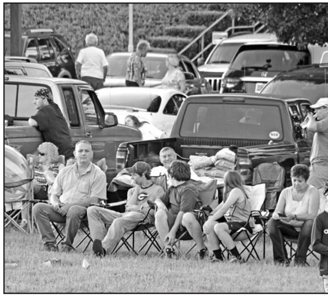
Hundreds of residents take over the front of North Georgia Technical College each year to watch the Fourth of July fireworks at Meeks Park.

First United Methodist Church, next door to North Georgia Tech, will be hosting free live music with $5 barbecue baskets. Drinks